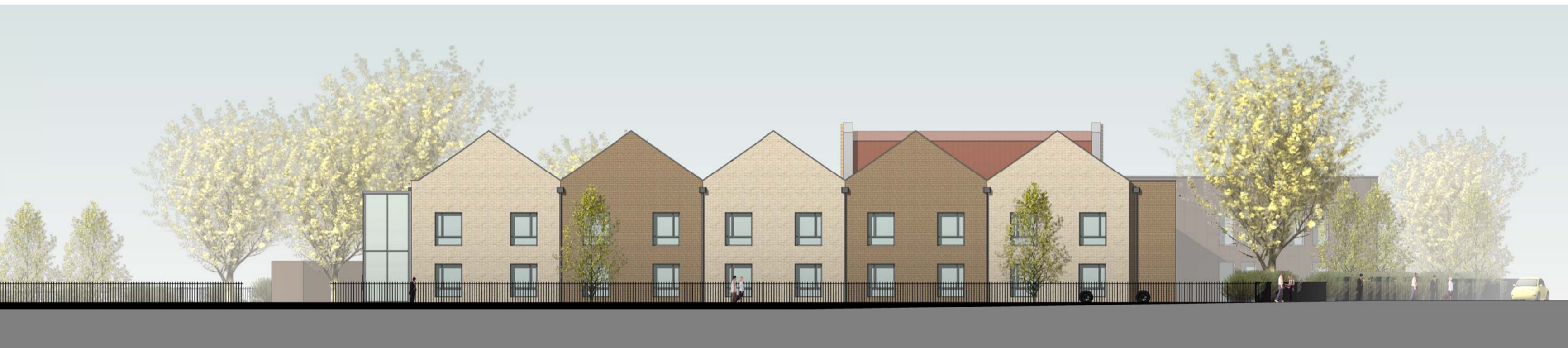
3 East Elevation to access road 1 : 200