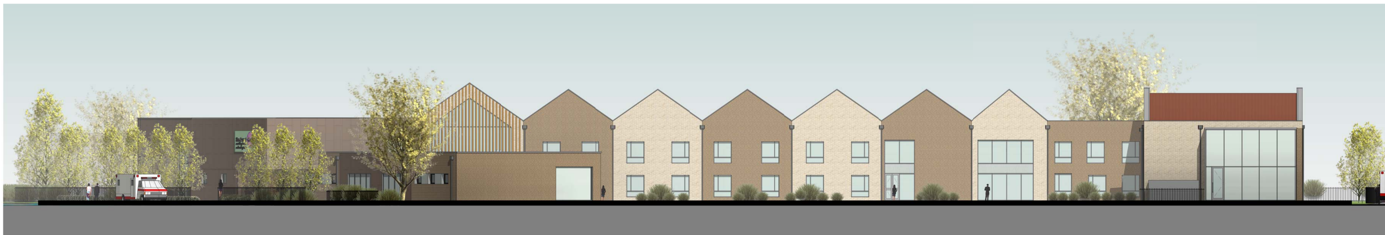
4 South Elevation to communal gardens 1 : 200