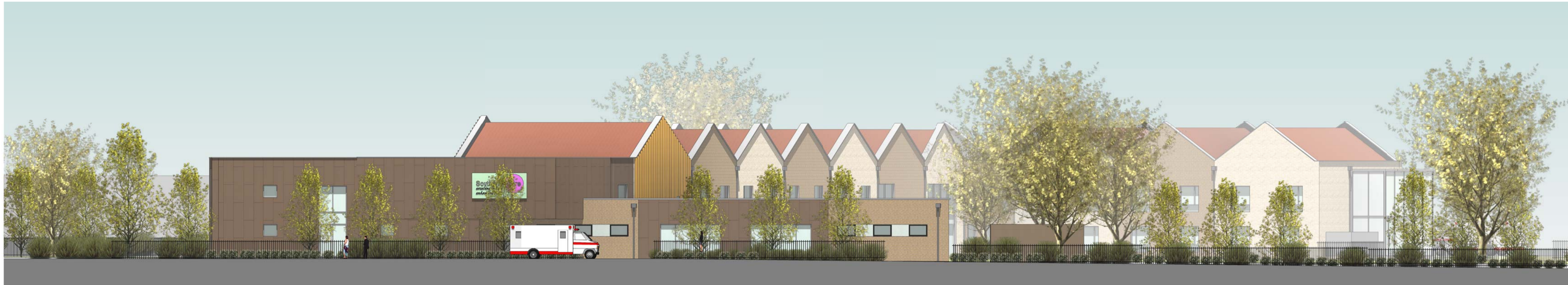
1 West Elevation to Prittlewell Chase 1 : 200

This drawing and design are the copyright of PELLINGS LLP.