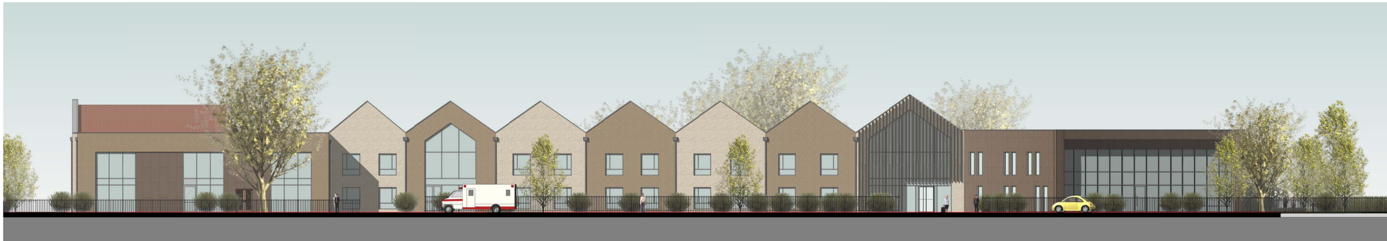
2 North Elevation to Burr Hill Chase 1 : 200